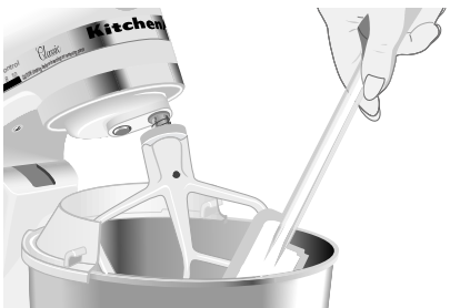
TO CLEAN: Wash in warm sudsy water. If you wish you may place on the top rack of your dishwasher.

Replace shield on rim of bowl by inserting the tabs under the tab openings and lowering to lock in place.